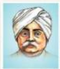
Lala Lajpat Rai