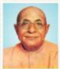
Mahatma Anand Swami