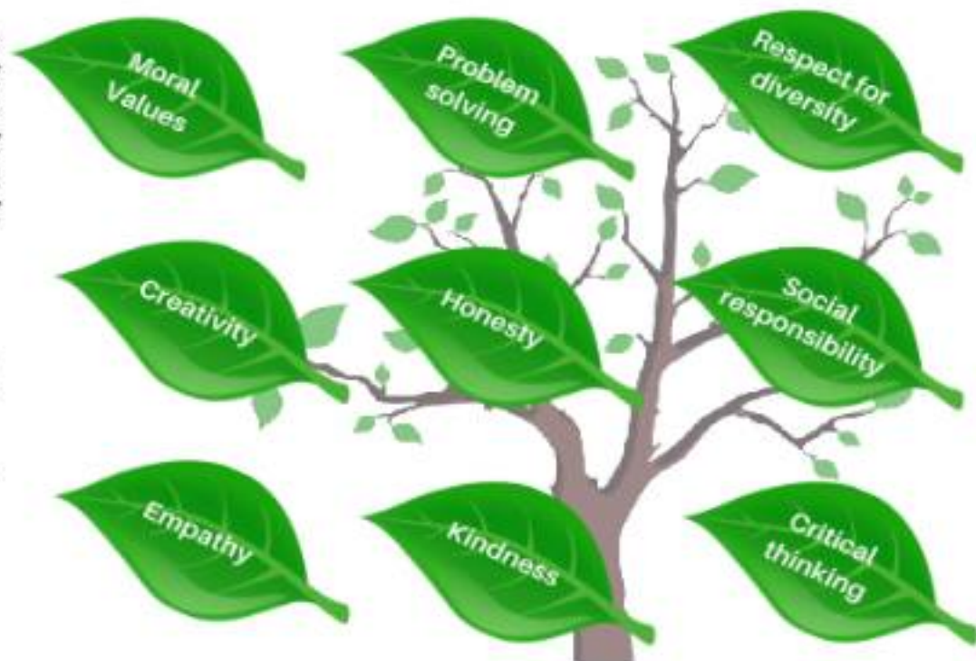
Our tree of values